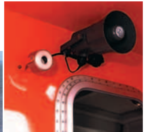
CT4 Camera in use by the RNLI aboard one of their Severn class all weather lifeboats.